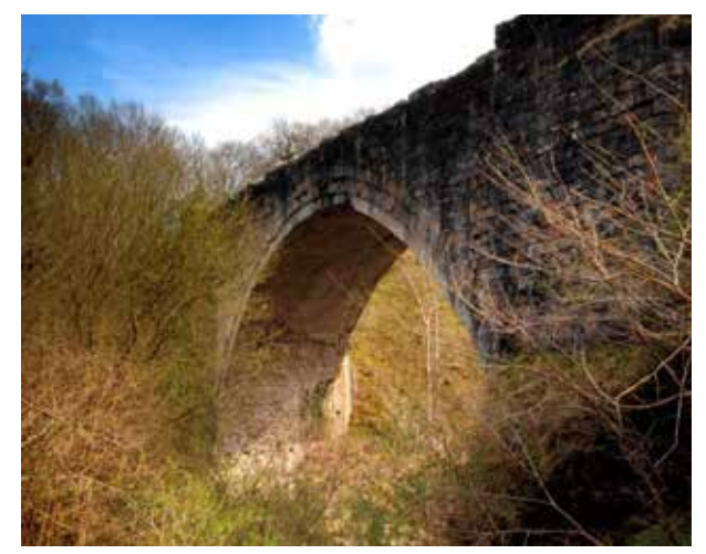
Tanfield Causey Arch