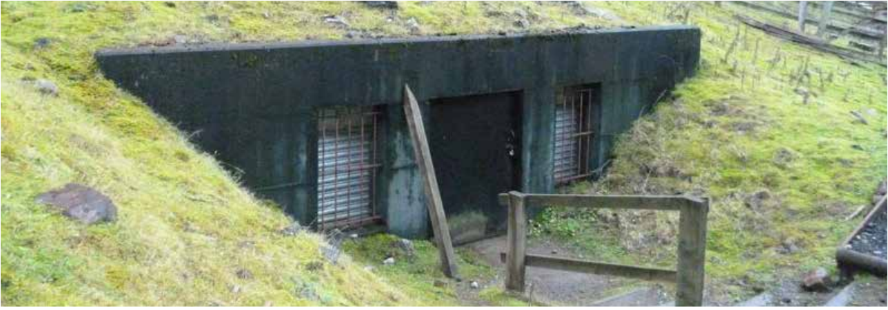
Killhope Lead Mining Underground Installation

Implementation of the Corporate Asset Management Plan will be led by the Corporate Director for Regeneration, Economy and Growth reporting through the Corporate Property Board. Governance arrangements are set out in more detail within Part 2 (the Asset Management Policy).