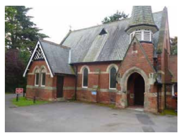
Ropery Lane Cemetery