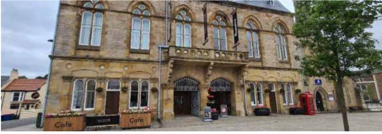
Bishop Auckland Town Hall