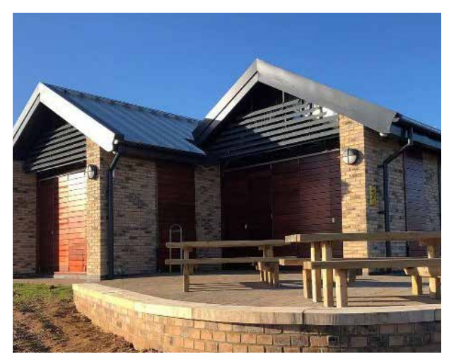
The Dunes Cafe, Crimdon

approach to acquiring property in order to support the Council's priorities. We need to ensure that we only acquire investments which meet our objectives and provide a reasonable level of return after considering all risks as part of a robust business case and due diligence process. How we then manage these assets must reflect and be determined by performance against these objectives.