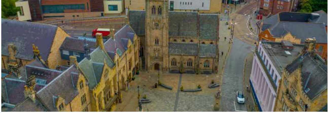
Durham Town Hall