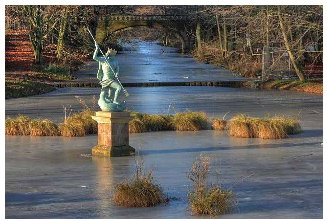
Hardwick Park - Statue of Neptune

Our work in the coming year will ensure that we have quality data, policies and procedures to drive improvement and have a property portfolio that we are proud of. The full Corporate Asset Management Plan 2025 will develop the current position and provide a longer term vision.