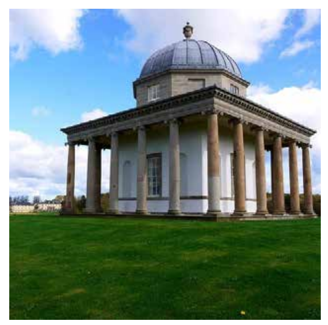
Hardwick Park - Temple of Minerva

As this initial Corporate Asset Management Plan is a first stage document, each of the three elements will be subject to review over the next 2 years to ensure they continue to meet and support corporate ambitions and priorities. In particular, the Asset Management Action Plan will be used as a live tool to direct and reflect asset management programmes of work undertaken and will be actively managed and amended as required.