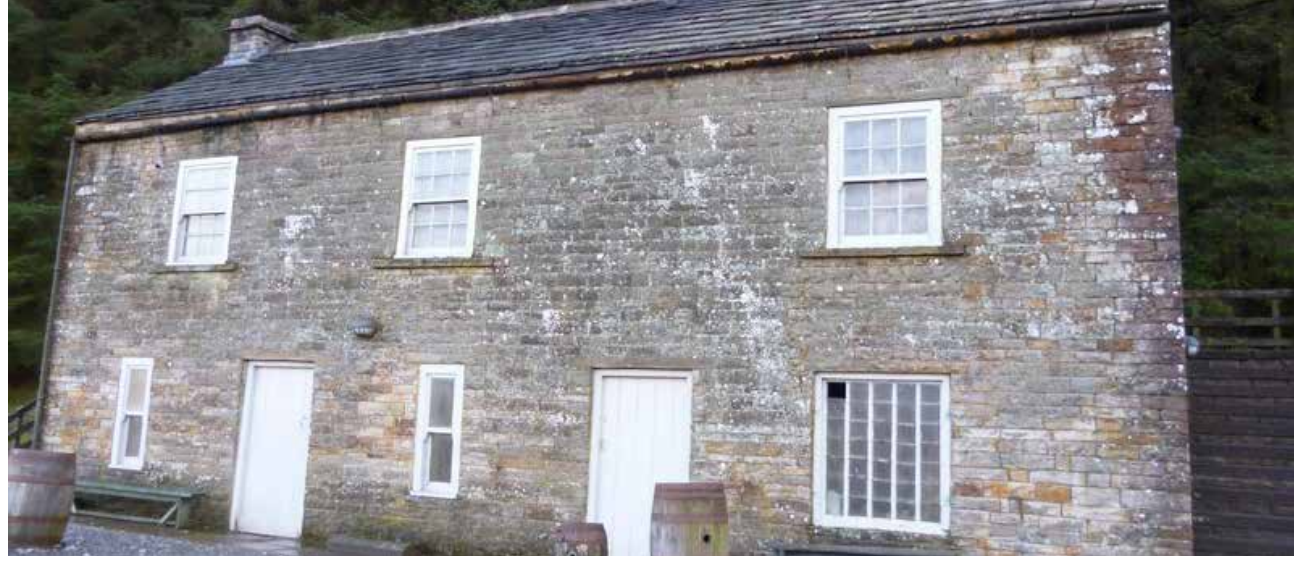
Killhope Lead Mining Centre - Lead Mining Shop and Store